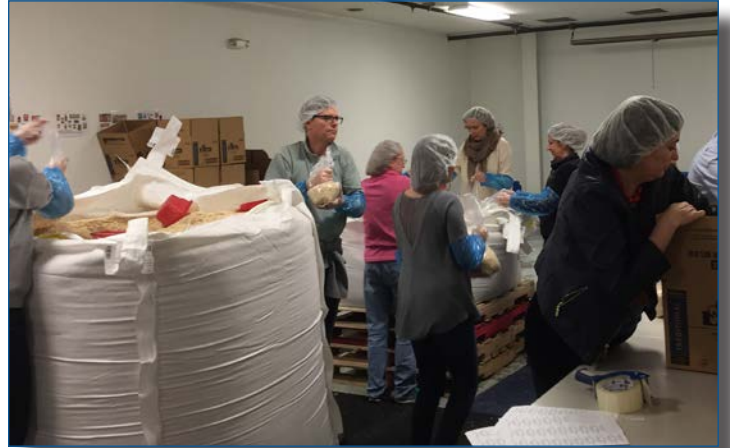
Service Day 2016 Idaho Foodbank