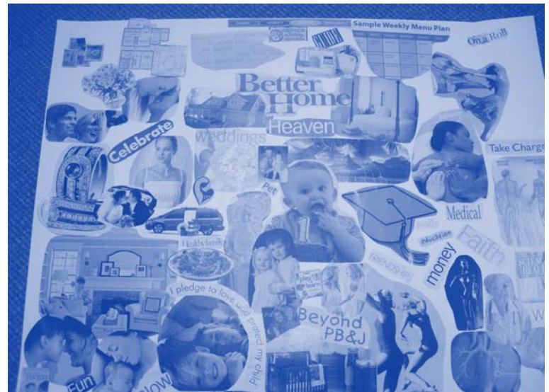
A “dream board” assembled by one of the participants in Baby Steps Step-Up Academy project.