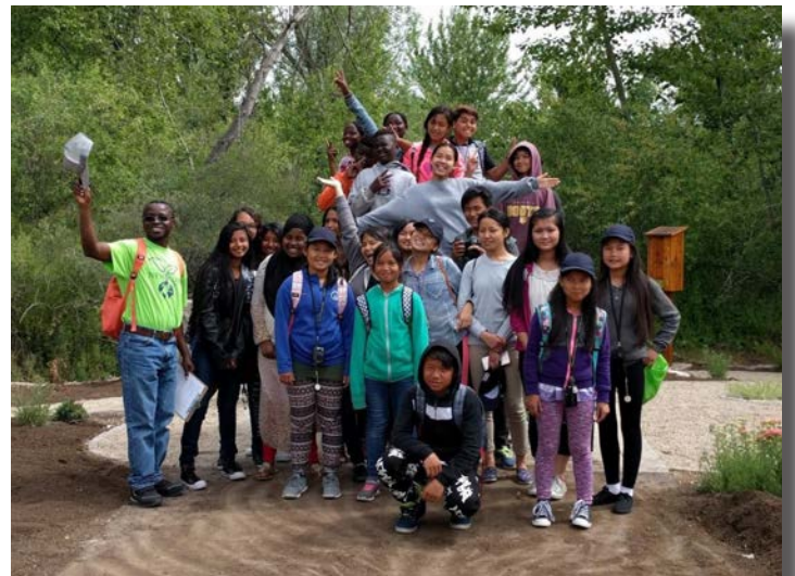
New Roots Group helping at Bee City 2017

The Grants Assessment committee has been a work in progress over the last two years, tweaking and creating the process of follow-up and data collection to ensure that we are doing due diligence for our IWCF members, as well as providing a meaningful and impactful granting process for our grantees. We are trying to gather information about the grantees while being mindful of the amount of reporting and types of follow-up questions we are asking. "How did it go? What would you do differently if you could? Do you have any suggestions for us in how we can make more of an impact?"