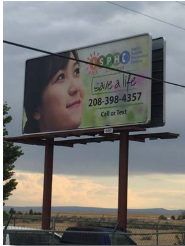
Elmore County Billboard: Idaho Suicide Prevention 2017