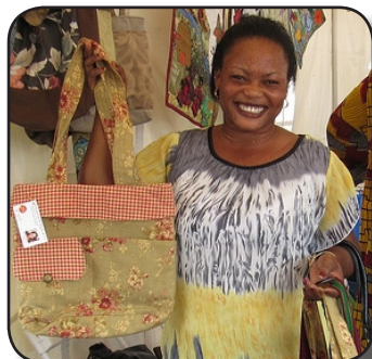
2014 Grantee Artisans4Hope

Dominican Overseas Education & Relief Society Drop in the Bucket Dustin's Paw Idaho Inc Eagle Food Bank EcoLogic Development Fund Elks Rehab Environmental Defense Fund Equestrian Order of the Holy Sepulchre of Jerusalem FINCA Family Advocate Program Family Advocates Fanconi Anemia Research Fund Farmer Veteran Coalition Feed the Gap First Congregational United Church of Christ First Unitarian Society First United Methodist Church of Boise Flagstaff Int'l Health & Education Focus North America Foothills School of Arts & Sciences Foundation for Ada-Canyon Trail Systems Foundation for Idaho History Free The Children International Free the Slaves Friends in Action Friends of Teton River Inc Friends of the Bishop House Friends of the Danbury Museum & Historical Society Friends of the Donnelly Library Friends of World Food Program Friends of Zoo Boise The Friendship Clinic Fund for Idaho Garden City Community Clinic Garden City Community School Garden City Library Foundation Garden Clubs of Idaho, Inc. Garden Valley Communications Garden Valley District Library Garden Valley School