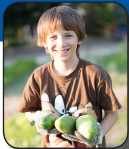
2014 Grantee Boise Urban Garden School

ACLU of Idaho Adoption Advocates International The Advocates Advocates for the West Agency for New Americans AJ's Angels Alpha Kappa Service Program Alzar School Alzheimer's Disease & Related Disorders Assoc. Amazima Ministries American Cancer Society American Film Institute American Red Cross of Greater Idaho American Society of Cinematographers Amyotrophic Lateral Sclerosis Assn. Andrew J. Somora Fnd Animals in Distress Association, Inc. ANSER of Idaho Inc. Aplastic Anemia & MDS Artisans4Hope Assistance League of Boise Balance Dance Company Ballet Idaho, Inc. Baltimore Medical System Baptist Bible Fellowship International Basque Museum and Cultural Center Bay Area Women's Sports Initiative Be the Change, Inc. Big Brothers Big Sisters of Southwest Idaho Bill Wilson Center Birds of Prey Northwest Birthright of Idaho Falls Bishop Kelly Foundation Blaine County Recreation District Blue Iris Flower Market Bogus Basin Lifetime Sports Education Foundation Bogus Basin Recreational Association Boise Art Museum, Inc. Boise at Home Boise Baroque Orchestra Boise Bicycle Project Inc. Boise City Parks & Recreation Boise Community Radio Boise Contemporary Theater, Inc. Boise Heritage Fund Boise Little Theater Boise Master Chorale, Inc. Boise Montessori PTO Boise Nordic Foundation Boise Philharmonic Association, Inc.