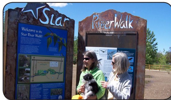
2011 Grantee Land Trust of the Treasure Valley

Member contributions to operations and event ticket sales continue to fund operating and staff expenses, as well as educational and social functions. Unrestricted Reserves, including Board-designated funds, grew by $787 during fiscal year 2015 and totaled $60,269 at year end. This Unrestricted Reserve and the earnings from the Endowment ensure that IWCF will remain a visible, vital force supporting informed philanthropy and community involvement well into the future.