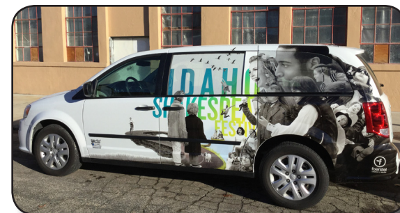
2014 Grantee Idaho Shakespeare Festival

Lillian Vallely School Lung Cancer Alliance Lutheran Community Services Northwest Make-a-Wish Foundation of Idaho Manitou Camp Experience Maplewood Academy March of Dimes Idaho Marol Academy Master Yoga Foundation