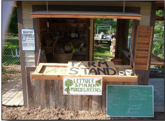
2009 Grantee - Boise Urban Garden School

Idaho State University Foundation Idaho Steelhead & Salmon Unlimited Idaho Suicide Prevention & Hotline Idaho Syringa Girls State Idaho Veterans Assistance League Idaho Voices for Children Idaho Women's Charitable Foundation Idaho Women's Charitable Foundation - Administrative Fund Idaho Women's Charitable Foundation - Pooled Fund Idaho Women's Network Ed & Research Fund Idaho Youth Ranch, Inc. Idaho Zoological Society Innerlight Women's Recovery Association Interfaith Alliance of Idaho, Inc. Interfaith Sanctuary Housing Services International Interior Design Association International Interior Design Association Foundation International Children's Surgical Foundation International Justice Mission International Rescue Committee Invisible Children Jackson Elementary School Jesse Tree of Idaho Junior Achievement of Idaho Junior League of Boise Idaho Juvenile Diabetes Research Foundation Lake Country Cares Cab, Inc. Land Trust of the Treasure Valley Learning Lab, Inc. Lee Pesky Learning Center Life's Doors Hospice Life's Kitchen