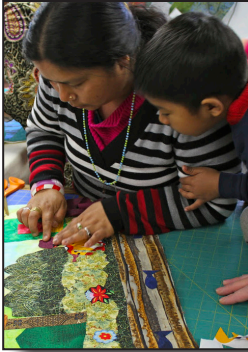
2014 Grantee - Artisans4Hope

ACLU of Idaho Adoption Advocates International The Advocates Advocates for the West Agency for New Americans Alpha Kappa Service Program Alzar School Alzheimer's Disease & Related Disorders Assoc. Amazima Ministries American Cancer Society American Film Institute American Red Cross of Greater Idaho American Society of Cinematographers Amyotrophic Lateral Sclerosis Assn. Andrew J. Somora Fund Animals in Distress Association, Inc. ANSER of Idaho Inc. Aplastic Anemia & MDS Artisans4Hope Assistance League of Boise Balance Dance Company Baby Steps Ballet Idaho, Inc. Baltimore Medical System Baptist Bible Fellowship International Basque Museum and Cultural Center Bay Area Women's Sports Initiative Be the Change, Inc. Baptist Bible Fellowship International Big Brothers Big Sisters of SW Idaho Bill Wilson Center Birds of Prey Northwest Birthright of Idaho Falls Bishop Kelly Foundation Blaine County Recreation District Blue Iris Flower Market Bogus Basin Lifetime Sports Education Foundation Bogus Basin Recreational Association Boise Art Museum, Inc. Boise at Home