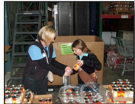
2009 Grantee - The Idaho Foodbank

The Cross at Tablerock Cru Idaho Dana Hall Schools Days for Girls Denver Dumb Friends League Denver Public School Foundation Discovery Center of Idaho, Inc. Doctors Without Borders USA, Inc. Dominican Overseas Education & Relief Society Dustin's Paw Idaho Inc EcoLogic Development Fund El Ada Community Clinick Elks Rehab Equestrian Order of the Holy Sepulchre of Jerusalem F I N C A Family Advocate Program Family Advocates Family Medicine Residency of Idaho Fanconi Anemia Research Fund Feed the Gap First Cong. United Church of Christ First Unitarian Society First United Methodist Church of Boise Flagstaff Int'l Health & Education Focus North America Foothills School of Arts & Sciences Foundation for Ada-Canyon Trail Systems Foundation for Idaho History Free The Children International Free the Slaves Friends in Action Friends of Teton River Inc Friends of the Danbury Museum & Historical Society Authority Inc Friends of the Donnelly Library Friends of World Food Program Friends of Zoo Boise Friendship Clinic Fund for Idaho Garden City Community Clinic Garden City Community School Garden City Library Foundation Garden Valley Communications Garden Valley District Library Garden Valley School Gateway School of Language and Culture Generation Life - Stanton Healthcare Genesis World Mission, Inc.