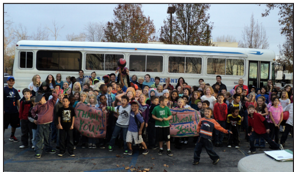
2013 Grantee - Boys & Girls Clubs of Ada County

U.S. Green Building Council UCSF Foundation Union College United Federation of Doll Clubs, Inc. United Methodist Committee on Relief United Nations Foundation United Service Organizations, Inc. United Way of Treasure Valley University of CA at San Francisco Foundation University of Idaho Foundation University of Idaho Foundation, School of Law University of Portland University of Texas Medical Branch University of WA Medicine Advancement University of Wisconsin Foundation Unplanned Good UofI, School of Law - Boise Campus Úsful Glassworks Vineyard Christian Fellowship Virginia Range Wildlife Protection Assoc. Whitney Elementary School Whitney United Methodist Church Wildland Firefighter Foundation Winsor School Annual Fund Wish Granters Women for Women International Women's and Children's Alliance Women's Business Center Women's Voices for the Earth Working Solutions World Bicycle Relief World Center for Birds of Prey World Relief Boise World Vision, Inc. WorldWide Fistula Foundation Wounded Warrior Project Wyakin Warrior Foundation Yosemite "Conservancy" Foundation Young Life - Idaho Region