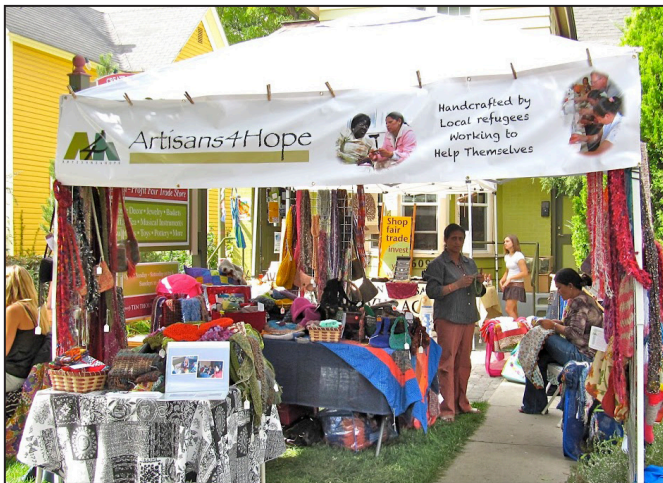
Artisans for Hope - 2014 IWCF Grantee

Member contributions to operations and event ticket sales continued to fully fund office staff and operations as well as educational and social functions with an excess $746 income over expenses. Unrestricted Reserves, including Board-designated funds, totaled $59,482 at year end. This built-up Unrestricted Reserve plus annual earnings from the Endowment secure the sustainability and future vitality of IWCF as an important voice for philanthropy and community involvement well into the future.