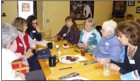
Book Discussion "Half the Sky" at Life's Kitchen

Fostering educated philanthropy, ensuring informed giving amongst our membership