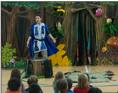
Idaho Shakespeare Festival

Family Advocates Development of Parents Anonymous Group in Ada and Canyon Counties $29,957.50 Funding will allow Family Advocates to become an accredited provider for Parents Anonymous®, a national evidence-based model of parent support to strengthen families.