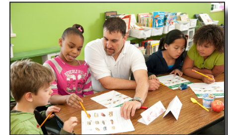
Junior Achievement of Idaho

Junior Achievement of Idaho Expanded Financial Literacy for Youth in SW Idaho $23,000 Funds will allow JA to expand in-class basic financial literacy programs to low-income and high-risk students K-12, giving them access to a business mentor and experiential curriculum in financial literacy.