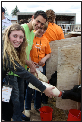
One Stone—2014 IWCF Grantee

ACLU of Idaho Adoption Advocates International The Advocates Advocates for the West Agency for New Americans Alpha K9 Service Program Alzar School Alzheimer's Disease & Related Disorders Assoc. American Cancer Society American Film Institute American Red Cross of Greater Idaho American Society of Cinematographers Amyotrophic Lateral Sclerosis Assn. Andrew J. Somora Fund Animals in Distress Association, Inc. ANSER of Idaho Inc. Aplastic Anemia & MDS Artisans4Hope Assistance League of Boise Balance Dance Company Baby Steps Ballet Idaho, Inc. Baltimore Medical System Basque Museum and Cultural Center Bay Area Women's Sports Initiative Be the Change, Inc. Big Brothers Big Sisters of SW Idaho Bill Wilson Center Birds of Prey Northwest Birthright of Idaho Falls Bishop Kelly Foundation Blaine County Recreation District Blue Iris Flower Market Bogus Basin Lifetime Sports Education Foundation Bogus Basin Recreational Association Boise Art Museum, Inc. Boise Baroque Orchestra Boise Bicycle Project Inc. Boise City Parks & Recreation Boise Community Radio Boise Contemporary Theater, Inc.