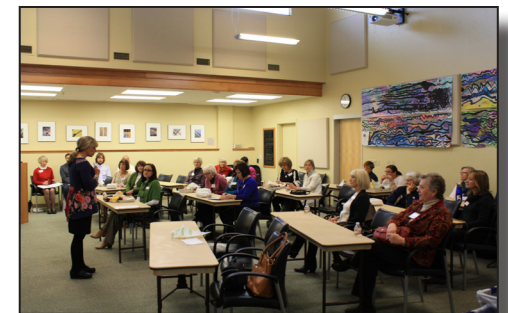
The 4 R's Lecture at the Boise Watershed Environmental Education Center