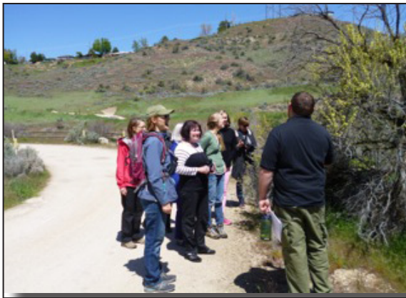
"Ecology of the Foothills" event