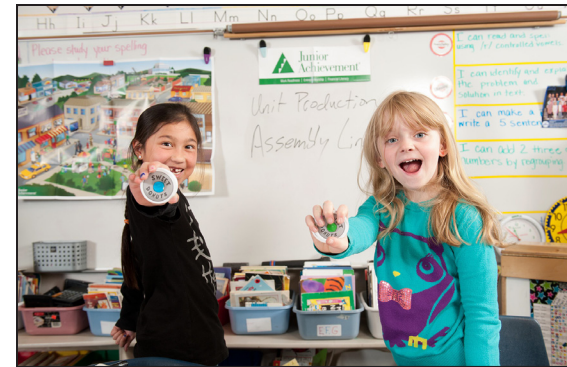
Junior Achievement of Idaho-2014 IWCF Grantee

Idaho Dance Theatre Idaho Diabetes Youth Program Idaho Edu. Public Broadcasting Fdn. Idaho Families of Adults with Disabilities Idaho Federation of Families for Children's Mental Health Idaho Foodbank Warehouse, Inc. Idaho Foundation for Parks and Lands Idaho Human Rights Education Center, Inc. Idaho Humane Society, Inc. Idaho Humanities Council Idaho Law Foundation Idaho Lions Sight & Hearing Foundation Idaho Meth Project Idaho Mountain Search and Rescue Unit Idaho Nonprofit Development Center Idaho PEO Chapter House Idaho Public Television Idaho Regional Ballet Idaho Rivers United, Inc Idaho Shakespeare Festival, Inc. Idaho Smart Growth Idaho State University Foundation Idaho Steelhead & Salmon Unlimited Idaho Suicide Prevention & Hotline, Inc. Idaho Syringa Girls State Idaho Veterans Assistance League Idaho Voices for Children Idaho Women's Charitable Foundation Idaho Women's Charitable Foundation - Administrative Fund Idaho Women's Charitable Foundation - Pooled Fund Idaho Women's Network Ed & Research Fund Idaho Youth Ranch, Inc. Idaho Zoological Society Innerlight Women's Recovery Association Interfaith Alliance of Idaho, Inc. Interfaith Sanctuary Housing Services International Interior Design Association International Interior Design Association Foundation