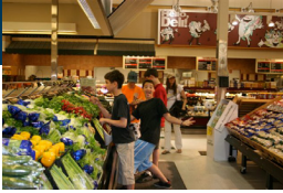
Boise Urban Garden School

Idaho Law Foundation Idaho Lions Sight & Hearing Foundation Idaho Meth Project Idaho Mountain Search and Rescue Unit Idaho Nonprofit Development Center, Inc. Idaho Public Television Idaho Rivers United, Inc Idaho Shakespeare Festival, Inc. Idaho Smart Growth Idaho State University Foundation Idaho Steelhead & Salmon Unlimited, Inc. Idaho Suicide Prevention & Hotline, Inc. Idaho Syringa Girls State Idaho Voices for Children Idaho Women's Network Ed & Research Fund Idaho Youth Ranch, Inc. Idaho Zoological Society Innerlight Women's Recovery Association Interfaith Alliance of Idaho, Inc. Interfaith Sanctuary Housing Services International Interior Design Association International Justice Mission International Rescue Committee Invisible Children IWCF Pooled Fund Jackson Elementary School Jesse Tree of Idaho Junior League of Boise Idaho Juvenile Diabetes Research Foundation Lake Country Cares Cab, Inc. Land Trust of the Treasure Valley Learning Lab, Inc. Lee Pesky Center Life's Doors Hospice Life's Kitchen Light for Life Foundation Lutheran Community Services Northwest Make-a-Wish Foundation of Idaho Maplewood Academy Marol Academy (The) Master Yoga Foundation McCall Ski Racing Team McPaws Regional Animal Shelter Meals on Wheels Program Mercy Beyond Borders Meridian Area Senior Citizens Association Metropolitan Youth Symphony Miles of Smiles (Children's Free Dental Clinic) Mini Joys, Inc. Modest Needs Foundation