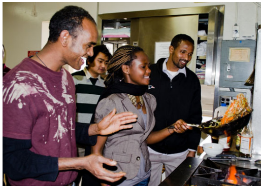
Students in Create Common Good's STIR Program

Education - Organization Assisting the Homeless Student Operation Treasure Valley $10,000 Boise IWCF support will help OATHS expand from the Boise School District to 2500 homeless students of the Treasure Valley giving them a better chance of enjoying, succeeding in and staying in school.