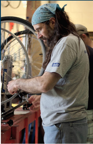
Students in Boise Bicycle Project’s “Work and Ride” program receive training and equipment

Environmental - $23,000 The Peregrine Fund Boise